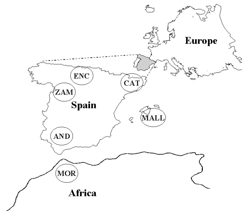
Figure 1. Geographical location of the Spanish donkey breeds.