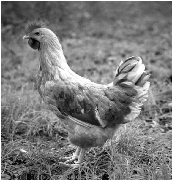
Figure 3. Blond Empordanesa hen.