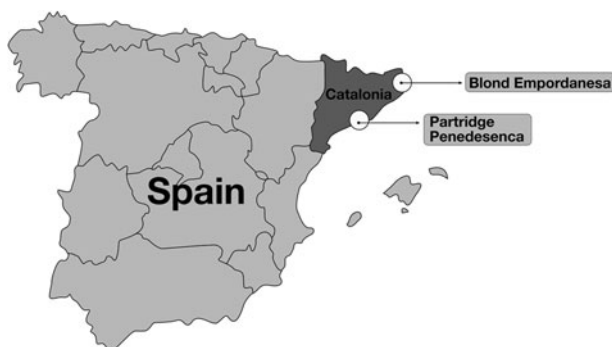
Figure 1. Geographical origin of Blond Empordanesa and Partridge Penedesenca hens in Catalonia (Spain).

The aim of this study was to propose a morphological characterization method of various chicken breeds by describing some zoometric measures and corporal indexes, and to validate it in two Catalonian autochthonous chicken breeds.