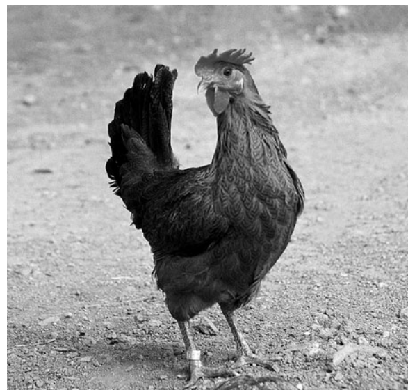
Figure 2. Partridge Penedesenca hen.